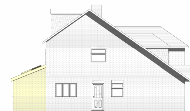
④ Proposed Side Elevation_2 1:50

Extract from planning document: Proposed Elevations and 3D Views, Revision 8, dated 24/05/2023.