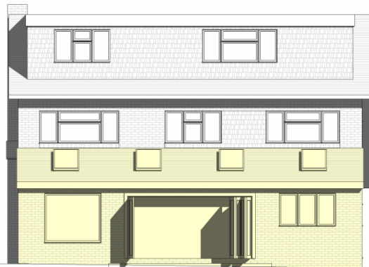
③ Proposed Rear Elevation 1:50