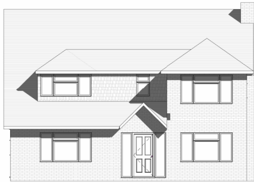
① Proposed Front Elevation 1:50