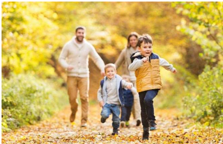
Health and wellbeing strategy