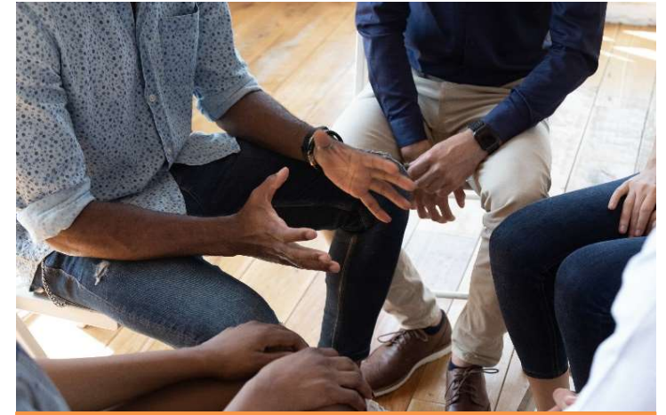
Hard to reach communities