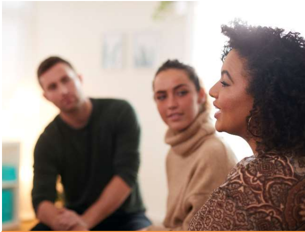
Services and access