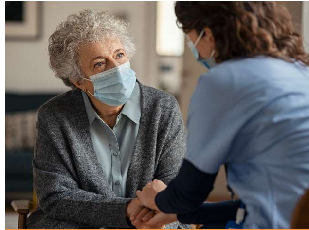
Impact of the pandemic