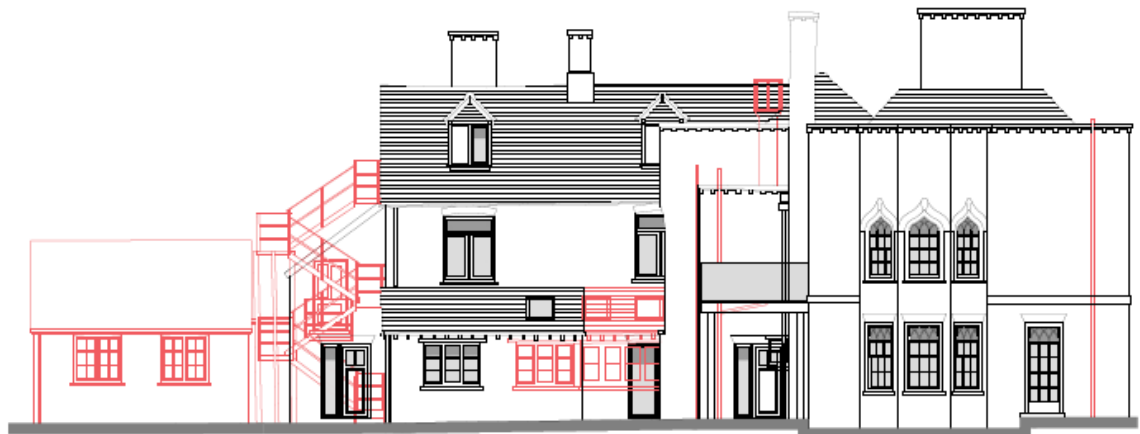
SIDE ELEVATION (North West Face)