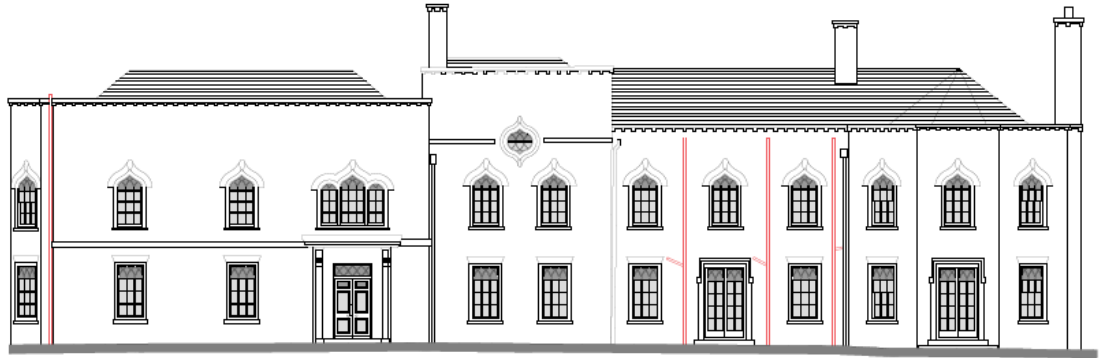
FRONT ELEVATION (South West Face)