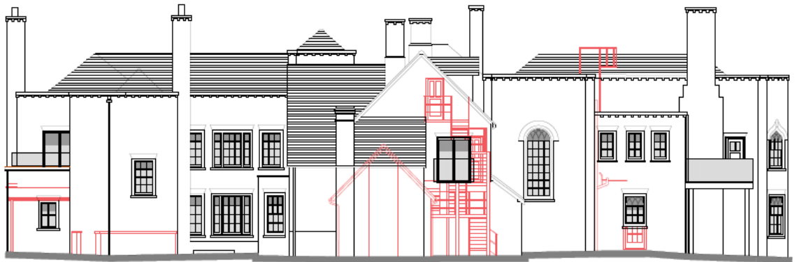
REAR ELEVATION (North East Face)