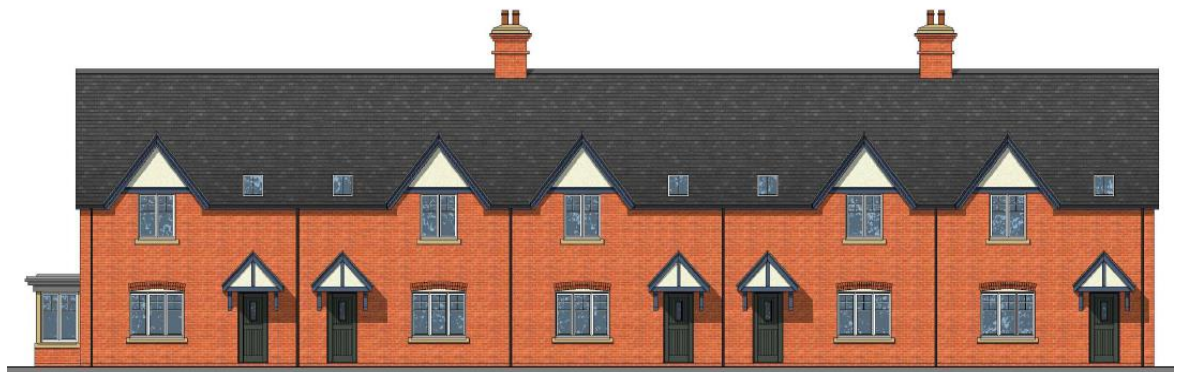
Front Elevation (Plots 1-5)