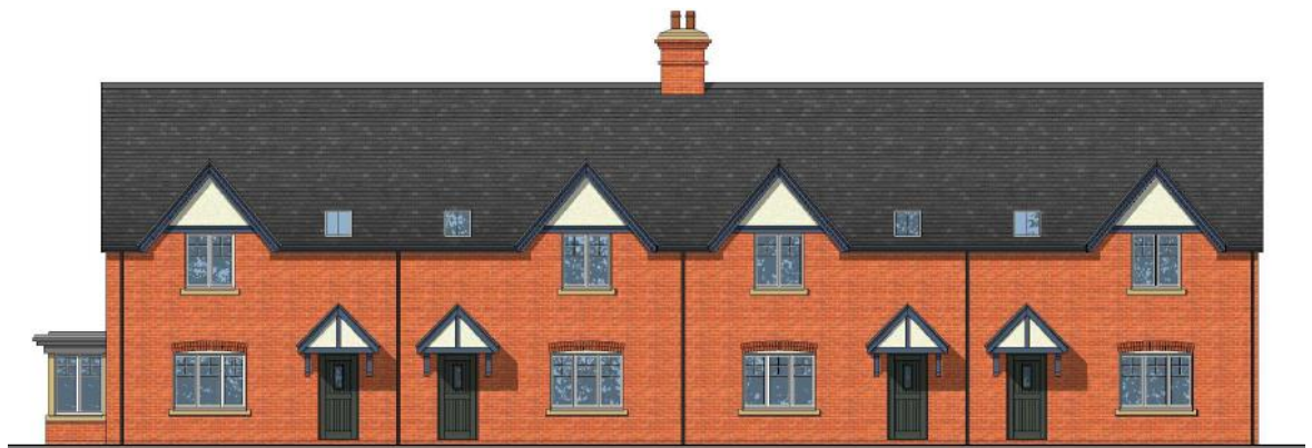
Front Elevation (Plots 6-9)

9.42 The cottages form an L-shaped range directly adjacent to Binfield House and will form 'cottages' in a traditional local vernacular form with a mix of high quality brickwork with render being used to add detail including chimney features, plain tiles and projecting gables with terraces and extending to 1.5 storeys. A two-storey element would be located the furthest away from the principal elevation of Binfield House and this element would be set at least 40m from Wicks Green to the west with dense landscaping in between. The proposals are considered to be acceptable to the surrounding development and would compliment the recent development at Hall Garden.