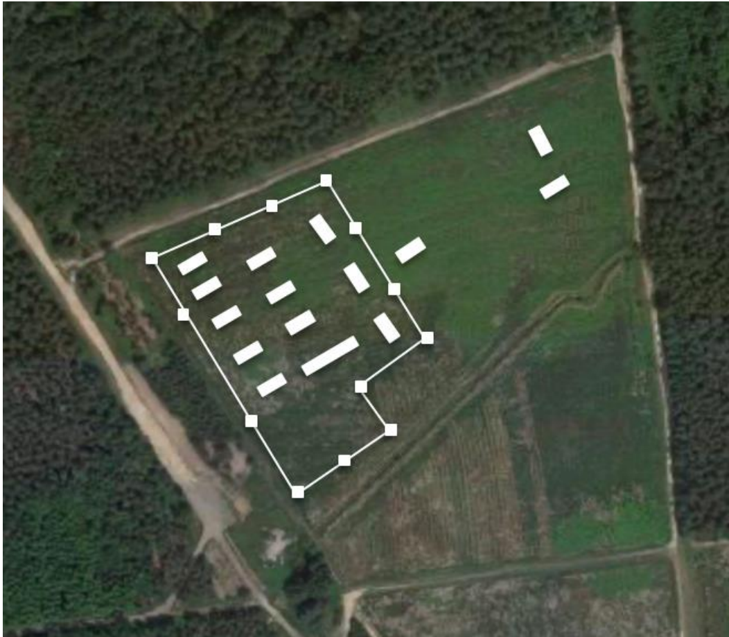
Set layout – showing approximate location of temporary set structures

5.2 There are no permanent or fixed structures proposed to be built. Set structures would not exceed 7.8m in height and would be made and constructed in situ and removed at the end of the filming period. Overnight accommodation would be provided on the site for security reasons during the construction and filming phases.