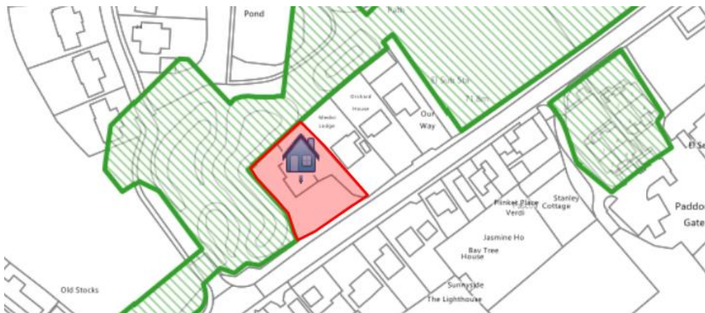
Figure 4: Site's northern and western boundary trees covered by TPO

9.41 It is considered that the introduction of two dwellings on this site would result in additional pressure on the existing offsite northern and western boundary trees than a previous approval in 2006 for a single dwelling. It is considered, given their growth potential, that there would be increasing pressures to prune these trees in the future if this proposal for two dwellings were approved with smaller rear gardens. The tall boundary trees would also be likely to form an oppressive feature where the residential outdoor space is reduced as proposed.