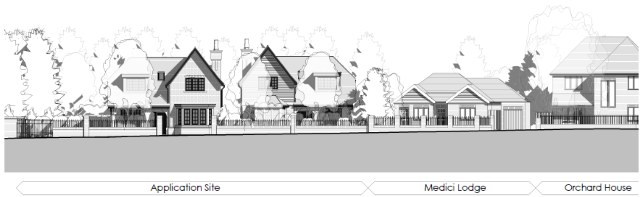
Figure 3: Case Officers illustration comparing the proposed dwellings with the existing building