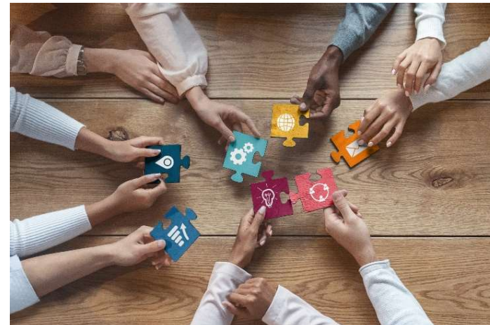
Relationships and collaboration